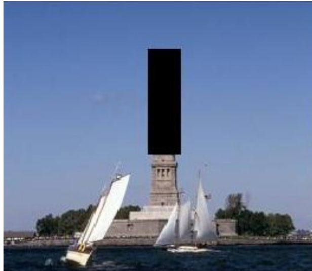
Fig. 4 Pixel removed Frame

In the fig 3, it shows the original input frame of a video. The frame consists of a consistent background which can be smoothly merged into the object. In this we have to select the object which has to be removed in the next step.