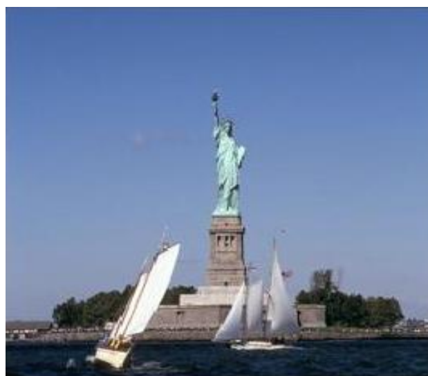
Fig. 3 Original Frame

By the use of Histogram tracking algorithm we tracked the object and inpainted that object using colour inpainting in which patch based method is used. All the selected frames are inpainted smoothly via optical flow which overcomes tedious hand labelling technique along with no artifacts are shown while playing the video. Following figure shows the result of video completion.