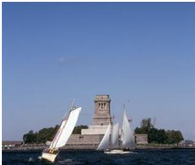
Fig. 5 Patch Inpainted output Frame

In the fig 4, it shows the object removed frame. I.e. the pixels of the object are made equal to zero. The black box shown in the figure shows the object cropped area.