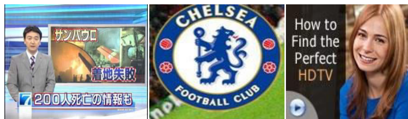
Fig. 2 Caption text images