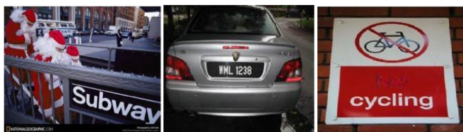
Fig. 3 Scene text images